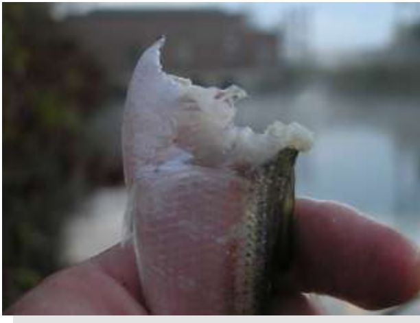
Billion dollar dam owner vs. migratory fish

Complaints filed in the cases cite findings by the National Marine Fisheries Service (NMFS) and U.S. Fish and Wildlife Service that dams “are among the leading causes of both historical declines and contemporary low abundance” of Kennebec and Androscoggin salmon, and that “dams remain a direct and significant threat to Atlantic salmon.” We also allege owners and operators of Weston and Shawmut dams, Lockwood dam, and Hydro Kennebec dam are violating specific language of their “water quality certifications” issued by the State of Maine (incorporated verbatim into their federal licenses) under the Clean Water Act, by allowing downstream-migrating adult salmon and adult shad to pass through dam turbines without first conducting studies to prove such passage is safe.