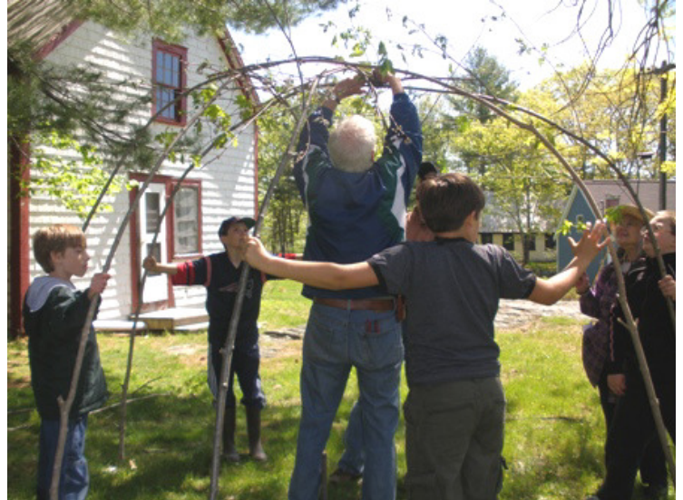
Local students learned about Native Americans through a new hands-on wigwam building exercise at Spring Bay Day.