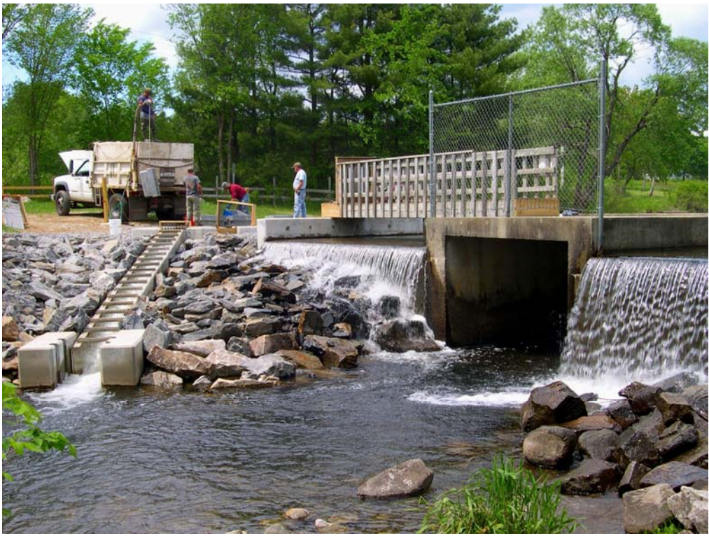
Clockwise from far left: The Benton Falls dam uses a fish lift to move spawning fish.