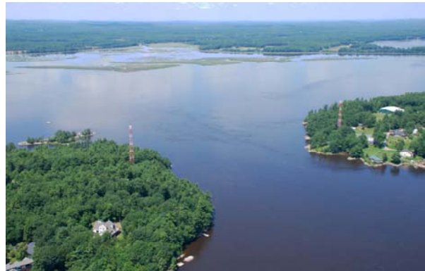
38% of Maine's water drains through The Chops and thanks in part to FOMB members, fish are still welcome!

Late Monday, June 15, the National Marine Fisheries Service (NMFS) and US Fish & Wildlife Service (USFWS) announced the expanded endangered species listing to include Kennebec, Androscoggin and Penobscot Atlantic salmon. This is now published in the Federal Register along with designated Critical Habitat which offers an extra layer of salmon protection in projects requiring federal permits.