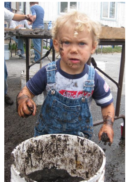
At Celebrate Bowdoinham, kids got a chance to get their hands dirty as they made a model of the Merrymeeting Bay watershed.