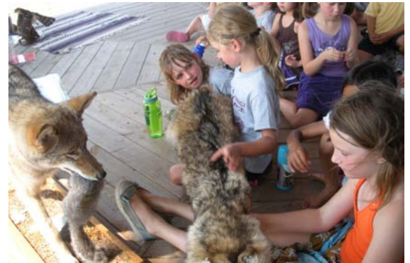
Campers get a close up of FOMB’s coyote, one of the many critters we bring with us on school visits.