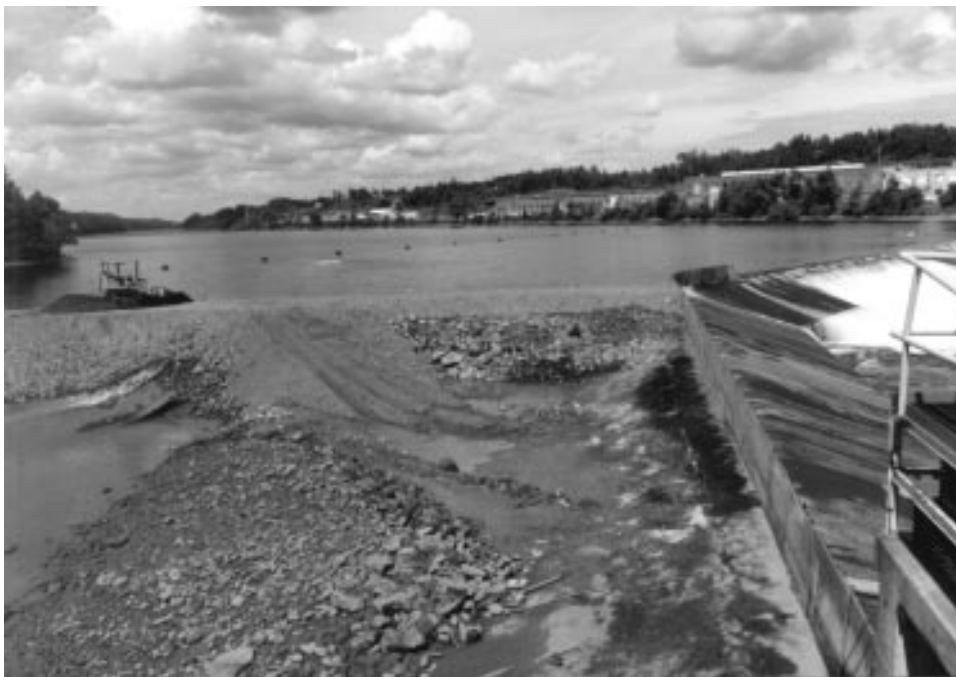
June 18: The temporary [coffer] dam is completed allowing access to the west end of Edwards Dam for heavy equipment to remove a 75 foot section.

Atkins and Foster identified three major problems. In order of severity, these were impassable dams, overfishing, and industrial pollution. They recommended the building of fishways, with specific suggestions and cost estimates for each dam. They advised various restrictions on the times and techniques of fishing for various species in various waters. They urged a careful consideration of the introduction of new species (e.g., large and smallmouth bass) into the state, and the wider dissemination of the Sebago salmon—our familiar landlocked salmon—be-