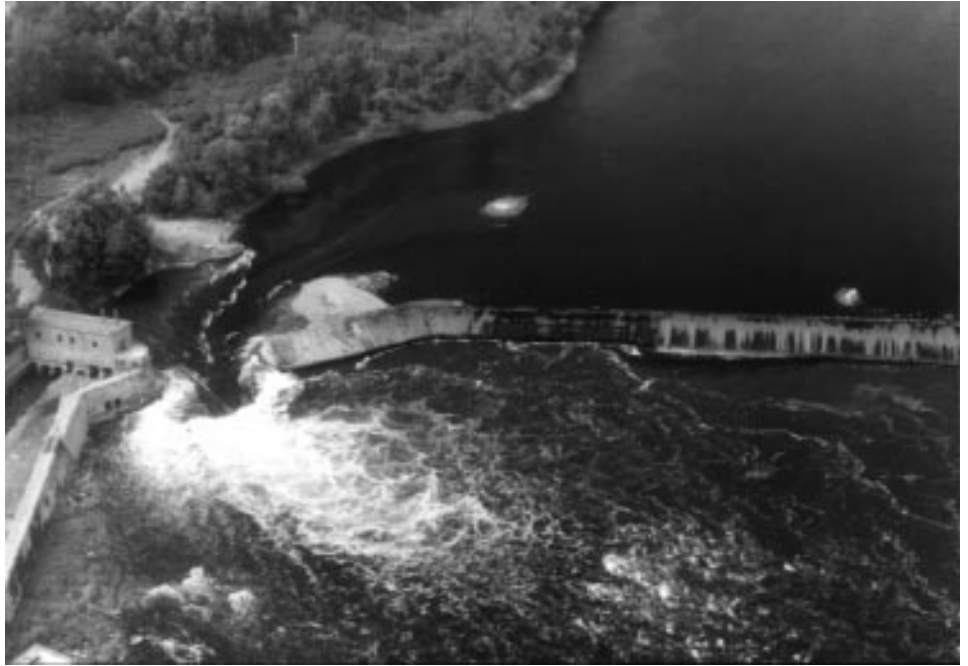
July 1: A section of the coffer dam is removed by an excavator bucket christened with a bottle of champagne. The trickle of the Kennebec quickly increases to a torrent as it erodes the gravel dam and roars through the Edwards breach.