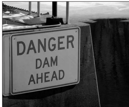
For fish that read. Sign mounted on the Ridgewood Power Dam in Gardiner.

From: 1818 Massachusetts Laws. Chapter CXXI. "An Act in addition to the several acts now in force for the